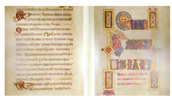
Vellum pages in the Book of Kells