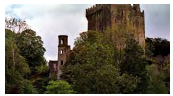
Castle Walls at Blarney