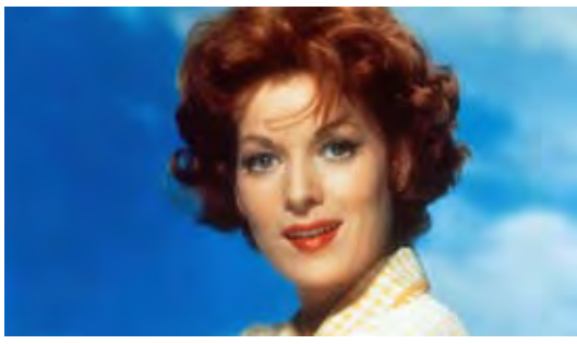
Red Haired Colleen (Maureen O'Hara)